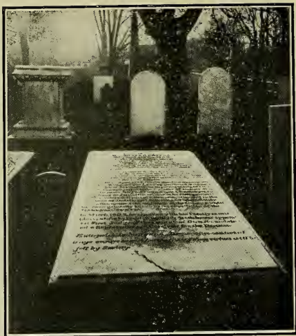
Tomb of Hon. Oliver Phelps.